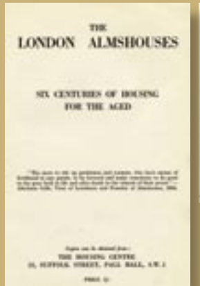
The St Pancras Almshouses are listed in the publication of 'The London Almshouses: six centuries of housing for the aged', 1944