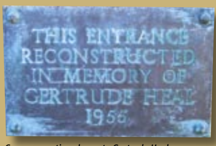
Commemorative plaque to Gertrude Heal