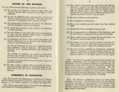
Annual Report showing 'duties of matron', 1940